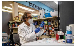
As demand for vaccinations wanes, thousands of shots are in danger of expiring in weeks.